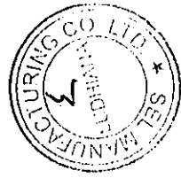
SEL Manufacturing Company Limited Table II - Statement showing shareholding pattern of the Promoter and Promoter Group