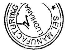
SEL Manufacturing Company Limited Table III - Statement showing shareholding pattern of the Public shareholder